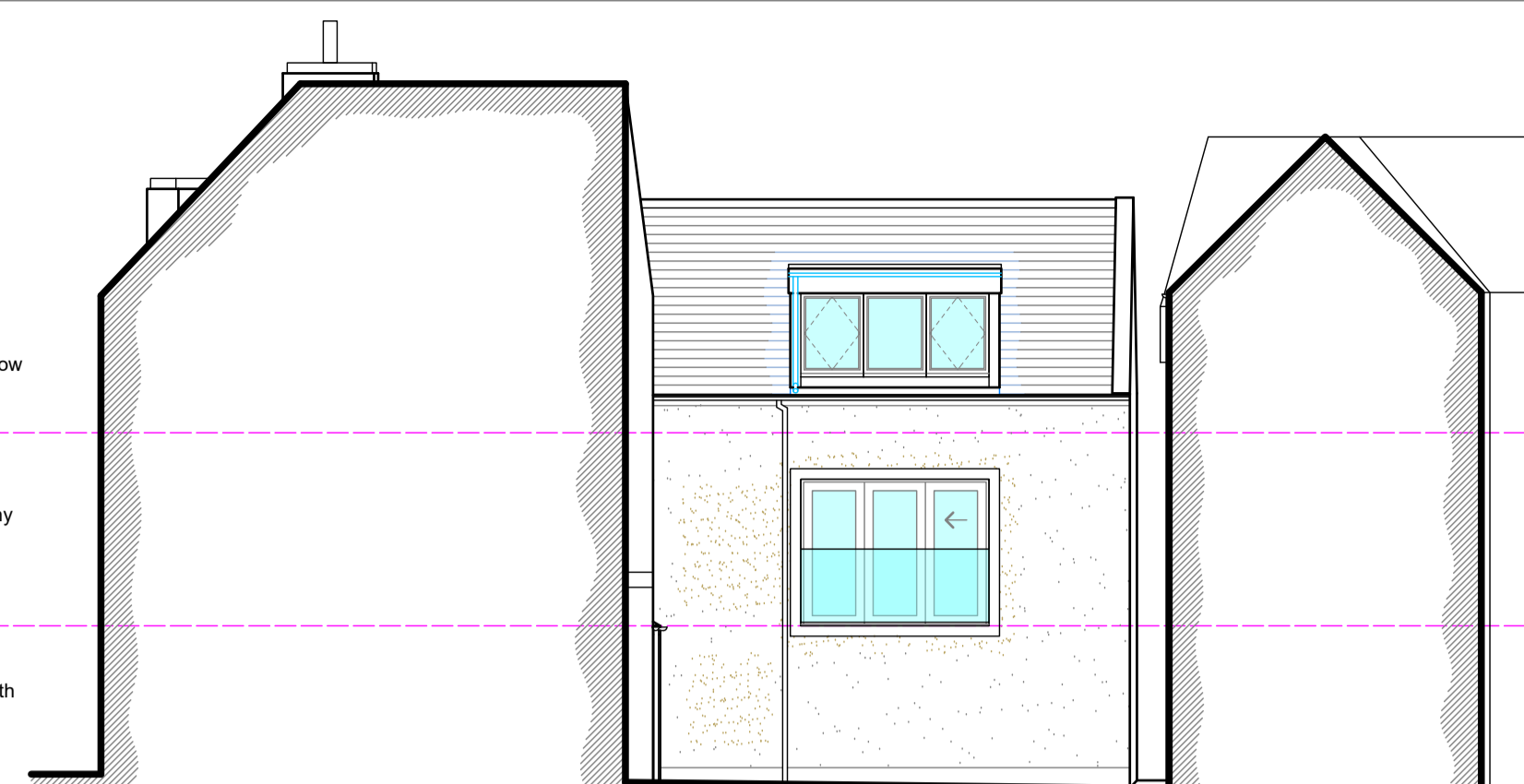
SECTIONAL NORTH ELEVATION

1:100 enlarge existing window to ensure bedroom 4 meets daylight regulations